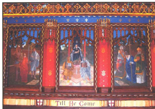
Altar screen funded by a grant from ACEST

The first meeting of the newly-formed Trustees was on 7th September 1972 and from the outset the alliance between the Aldershot and CESSAC members was a complete success and they have worked as a team throughout. An early policy decision was that individual applications for grants could not be considered. Grants could be made only to units on application in a specified format through designated channels and this has been strictly followed. Otherwise a substantial part of the income was likely to be swallowed up in office rent, staff salaries and overhead expenses. The method adopted meant the employment of one part-time Clerk to the Trust who used his home as his office.