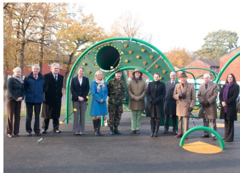
Renovated children's play park in Sandhurst (Nov 2010)