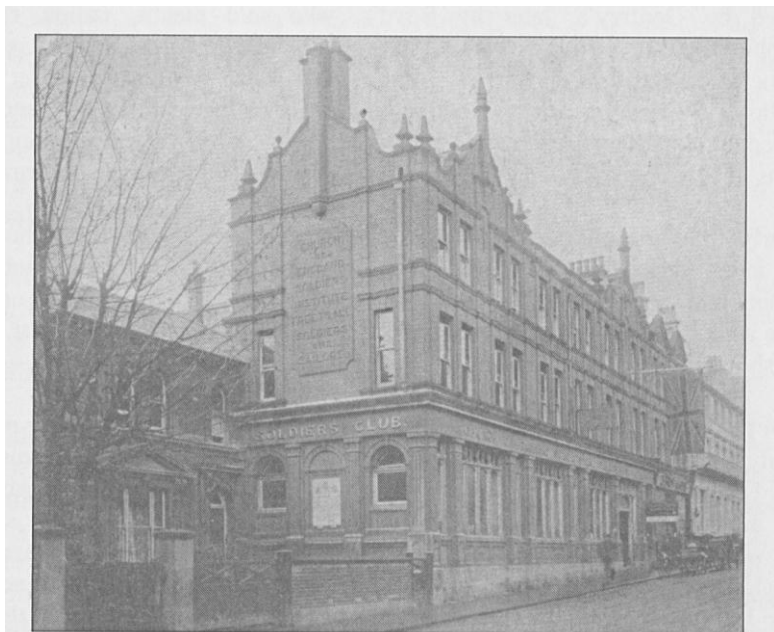
Church of England Soldiers and Sailors Institute, Aldershot.

The first approach was made to the Charity Commissioners for permission to sell up and for the Trustees to administer a fund under the cy-pres doctrine instead of an Institute. The Charity Commissioners gave the Trustees excellent service. There were differences of opinion on some matters, two of which are worthy of mention: