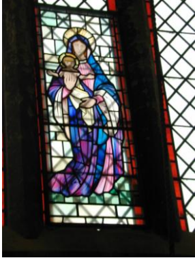
A chapel window funded by a grant from ACEST

The Trustees have met quarterly, or more often if required, in order to deal with applications for grants, to review investments and other necessary business. Income began to exceed requests and unspent income started to build up. It became apparent that a need existed to extend the application of benefit to former members of the armed Services as well as those currently serving. Accordingly, in December 1976, representations were made to the Charity Commissioners for the scheme to be enlarged to this effect. The required order of the Commissioners was sealed on 7th July 1977.