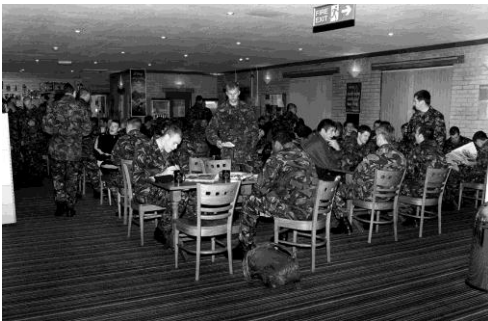
A troops' club renovation

Where Trust funds have been available grants have been made towards specific projects at the Royal Star & Garter Home, Richmond, and St Dunstan's in view of their strong support of ex-Servicemen/women.